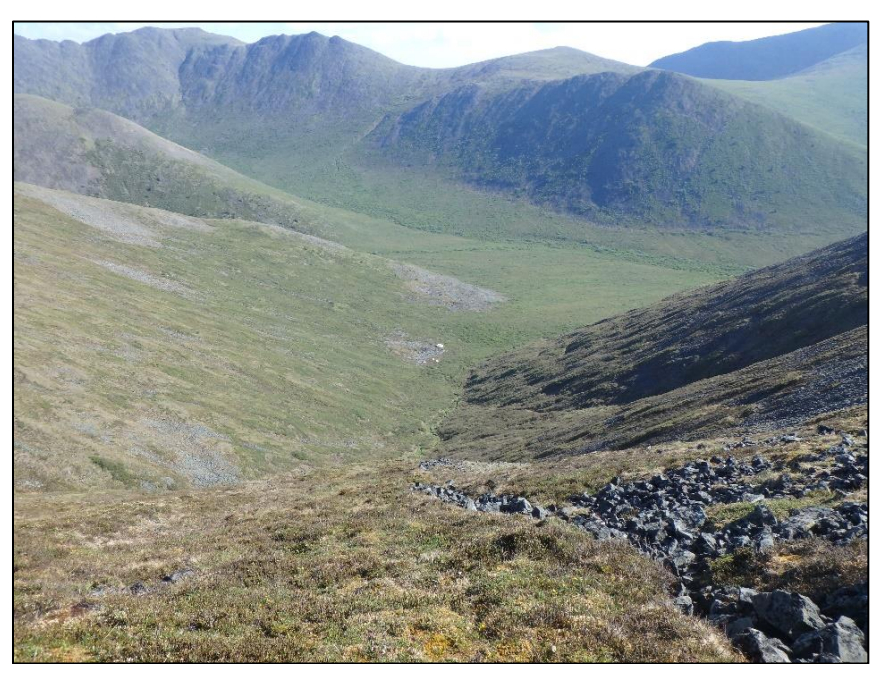
ALPINE TERRAIN AT TRIPLE CROWN

The Triple Crown property is one of the best, undrilled prospects in the Dawson Range Gold Belt, which includes the Coffee, Klaza, Casino and other deposits. Planned roads to improve access into the known deposits will also benefit the Triple Crown and other early-stage projects in the area.