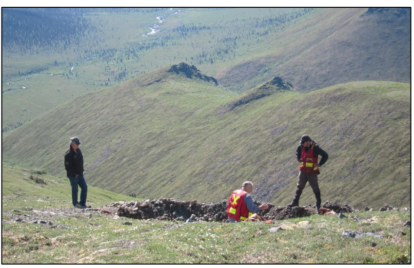
EXAMINING HAND TRENCHES ON THE PROPERTY

The Triple Crown property lies within the Yukon-Tanana Terrane, a continental arc that was developed along the ancient Pacific margin of North America from Late Devonian to Permian. Regional-scale mapping shows the property is underlain by Mid-Cretaceous Whitehorse Suite granodiorite to syenite, which is mostly capped by Early Tertiary Carmacks Group intermediate to basic volcanic and volcaniclastic rocks.